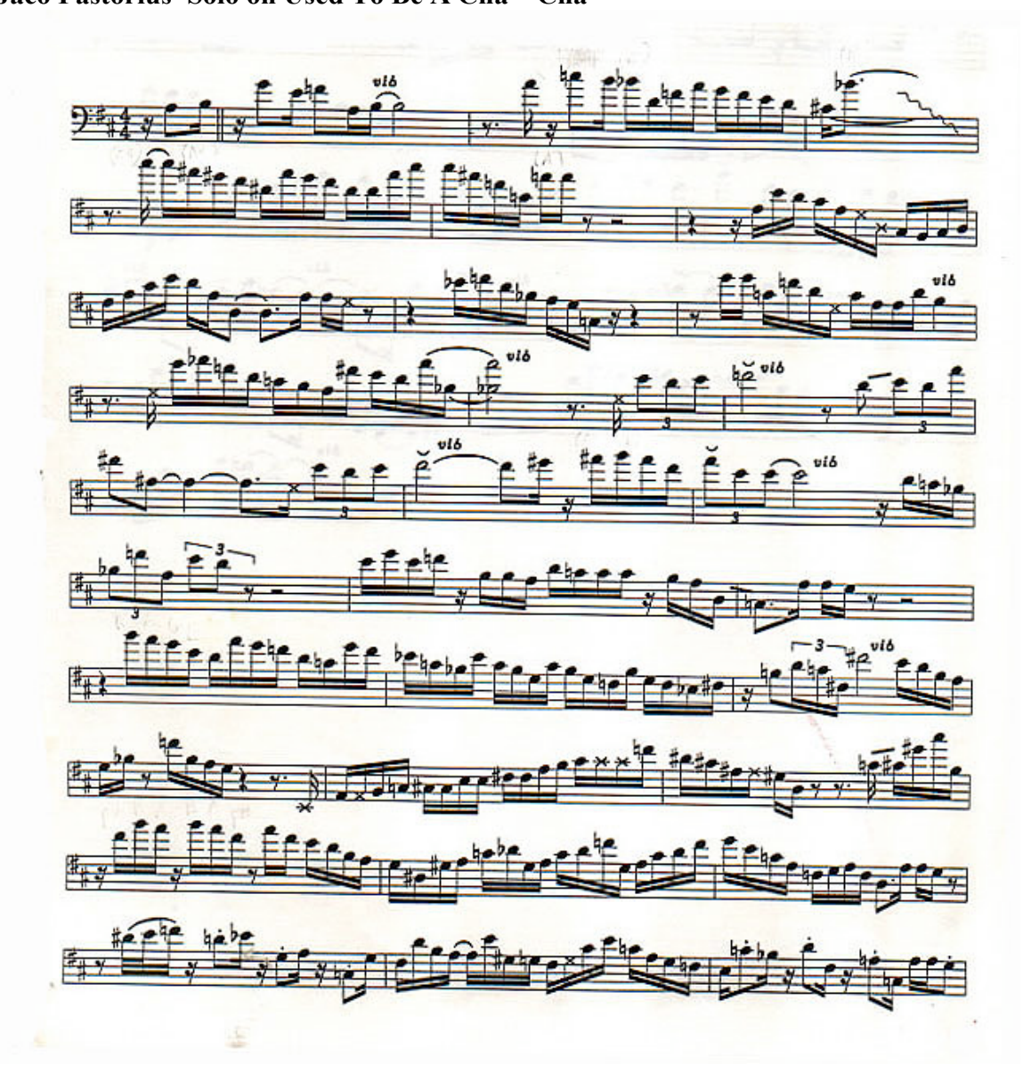
Jaco Pastorius' Solo on Used To Be A Cha - Cha