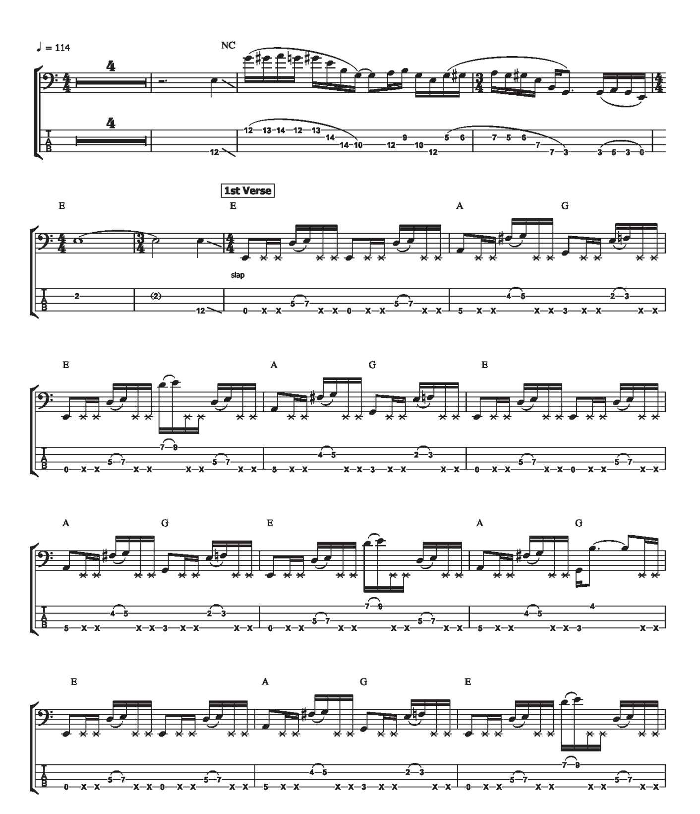
This transcription is intended for educational purposes only and must not be copied, distributed or sold without permission from the copyright owners.